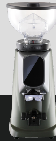
Sage & Satin Silver