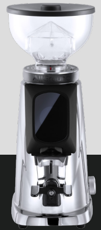
Chrome Plated & Deep Black