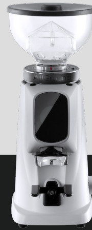
Artic White Matt