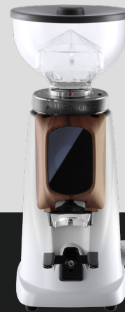
Artic White & Walnut