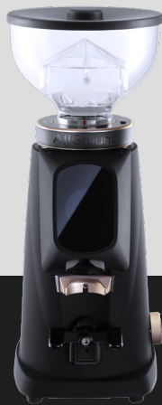
Deep Black & Rose Gold