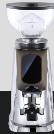
Chrome Plated & Rovere Old